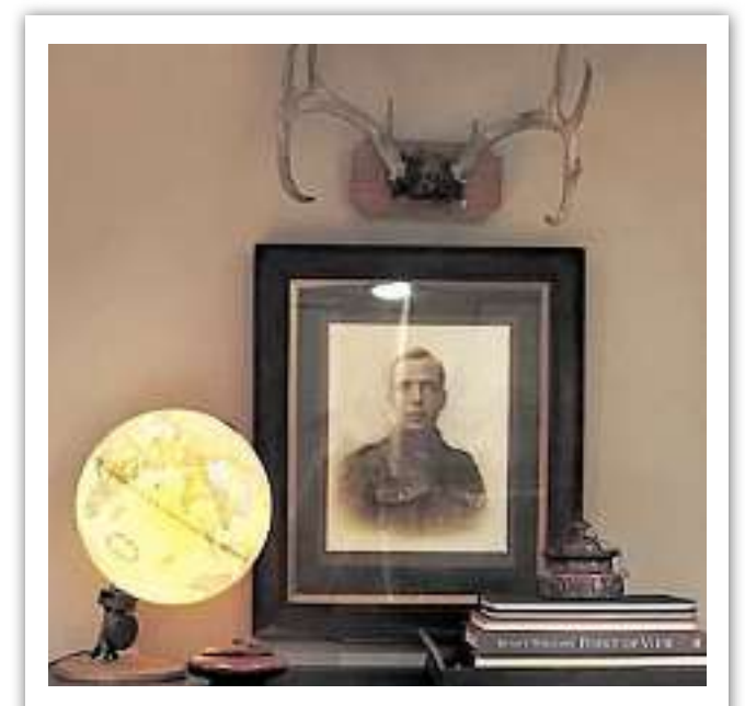
Introducing unique accessories leaves a balance between the style crated by the design firm and having a personal space.

As an interior decorating and styling firm, there are many retailers that we like to source