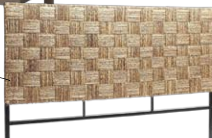
Seagrass Block Headboard. $200-$390. Visit pier1.ca