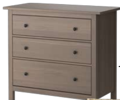
Hemnes Three Drawer Chest in Gray-Brown. $150. Visit ikea.ca