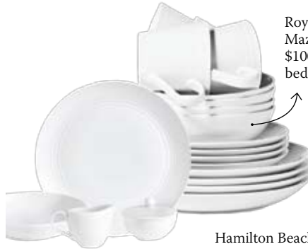
Royal Doulton Gordon Ramsay Maze White Dinnerware. $100 for 16-piece set. Visit bedbathandbeyond.ca