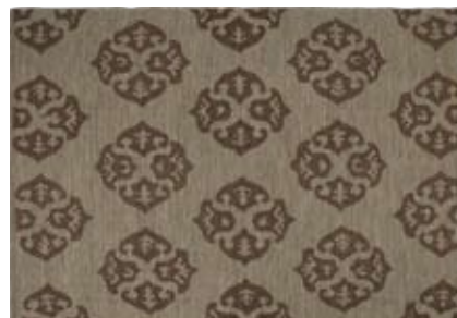
Bendale Rug by Korhani Home. $134 for 5x7. Visit rona.ca