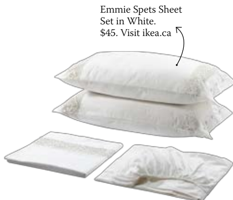
Emmie Spets Sheet Set in White. $45. Visit ikea.ca