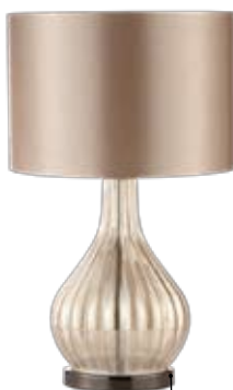
Table Lamp. $70. Visit bouclair.com