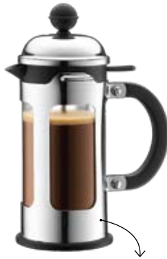
Bodum Chambord Four Cup French Press with Locking Lid. $50. Visit thebay.com