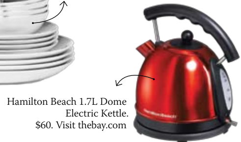
Hamilton Beach 1.7L Dome Electric Kettle. $60. Visit thebay.com