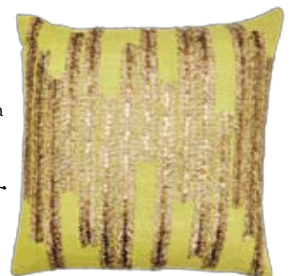
Sequined Striped Pillow. $49. Visit chapters.indigo.ca